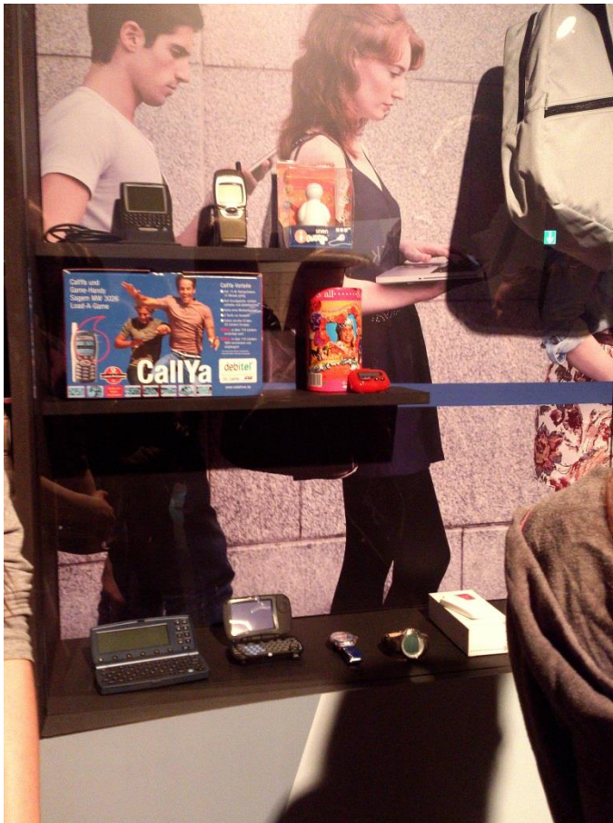
Modern technical things for