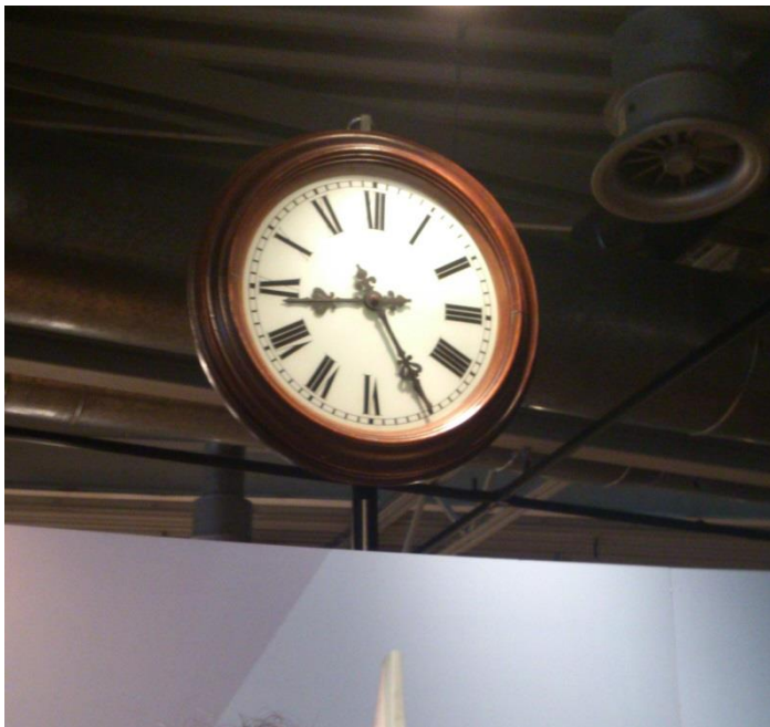
An old clock

Also the means of transportation changed. In the past the people drove with a coach or they walked. Later the bike, train, ship, plane and car were invented. The train and the ship were very slow compared to today. Today we have the ICE or fast planes and ships. We can drive the car with a high speed.